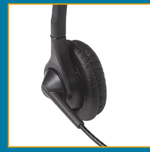
Soft Rubber Ear-Muff