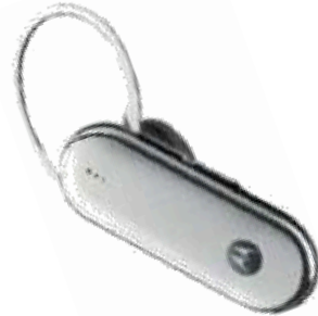
Standard Bluetooth Headsets