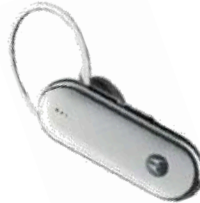
Standard Bluetooth Headsets