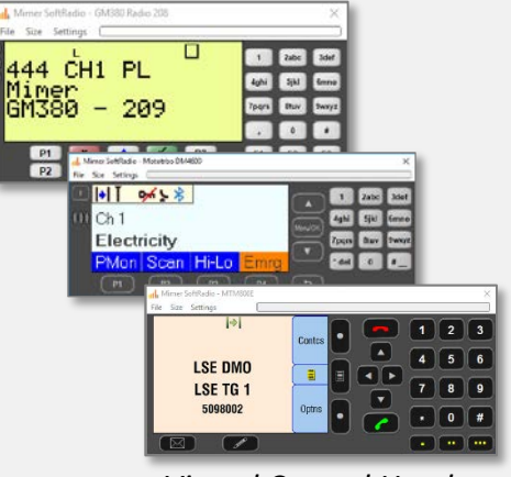
Virtual Control Heads

The system allows for mixing of radio types at the same operator, so that analogue radios (e.g. Marine and Airband) and digital radios (e.g. DMR and Tetra) can be controlled.