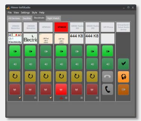
Mimer SoftRadio with six radios and one phone connected

Optionally all audio can be recorded and calls can be cross patched between radio systems. Also phones and intercoms can be operated from the same PC.